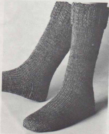
BOOKLET 6014 PAGE 2

These Socks have been specially designed for the size range given, and it is regretted that no other adaptations are available.